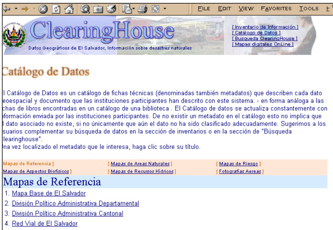
Graphic shows the catalog page of a country Clearinghouse WEB Site with metadata links

The goal of the project is to provide a one-stop shop for users of disaster information. Because the disaster data concept is so broad, the project has